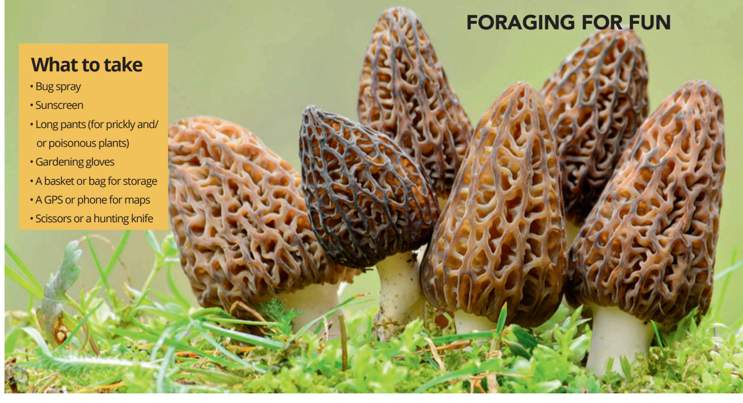
Morel mushrooms are a favorite target for many foragers in search of free food and fun.

morning," she said of her husband, her frequent foraging field companion. "I enjoy getting out and gathering the berries and he enjoys the jelly, so it makes everybody happy."